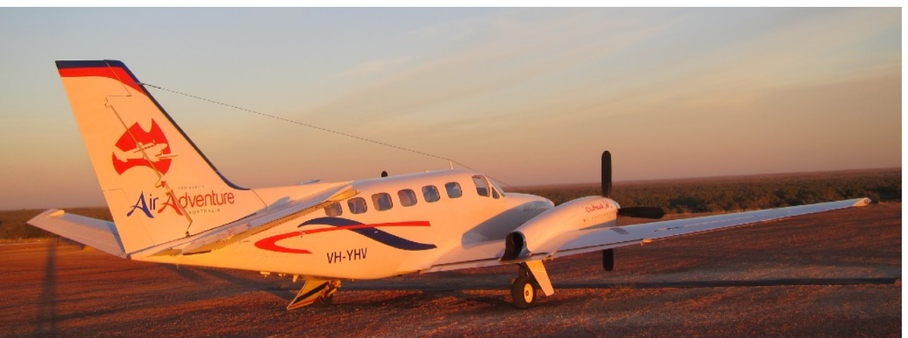
Images from top to bottom: The Flinders Ranges; Longreach Airport and Founders Museum; The Air Adventure Outback Jet