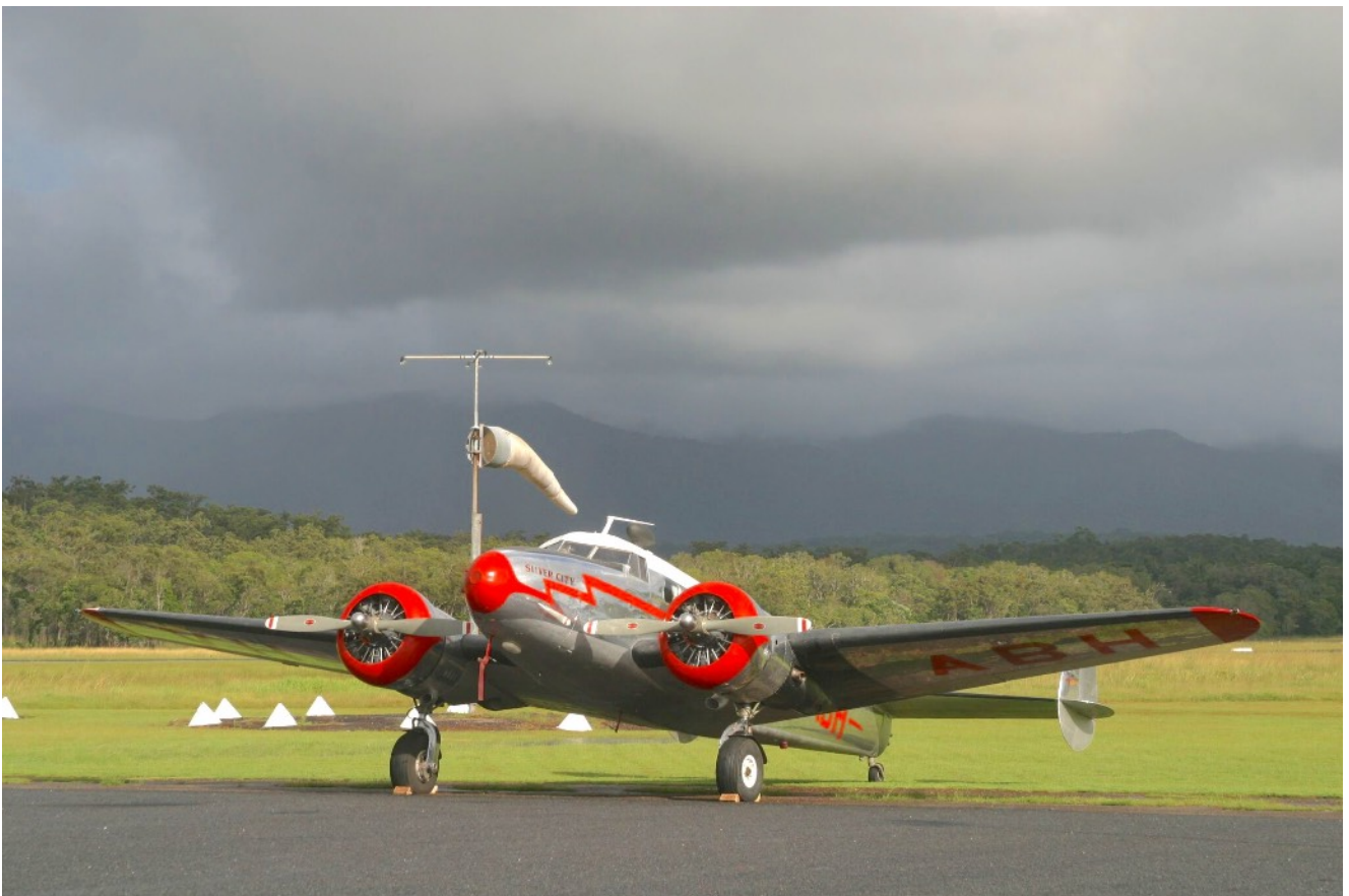
Clockwise from left: 'Feral' antipasto, Prairie Hotel; licensed since 1872 the heritage accommodation at the Prairie Hotel; The 'Silver City' Lockheed Electra Jr